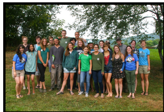
2015-2016 SerVermont VISTA Team