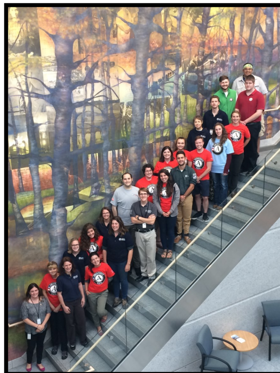
2016-2017 SerVermont VISTA Team