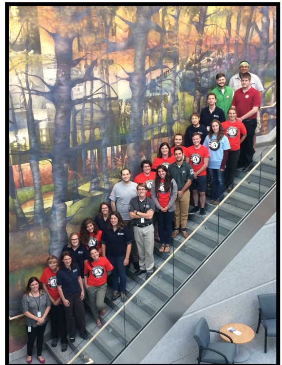
2016-2017 SerVermont VISTA Team