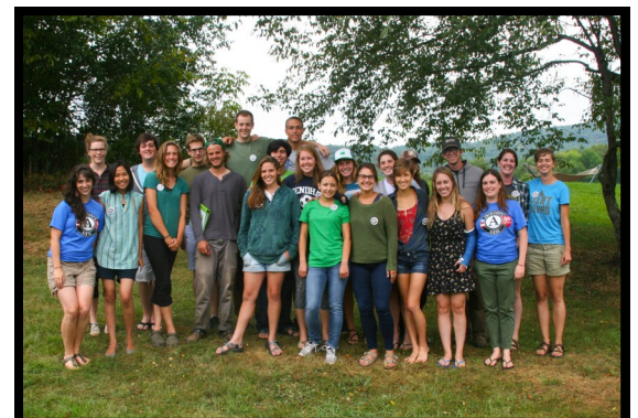
2015-2016 SerVermont VISTA Team